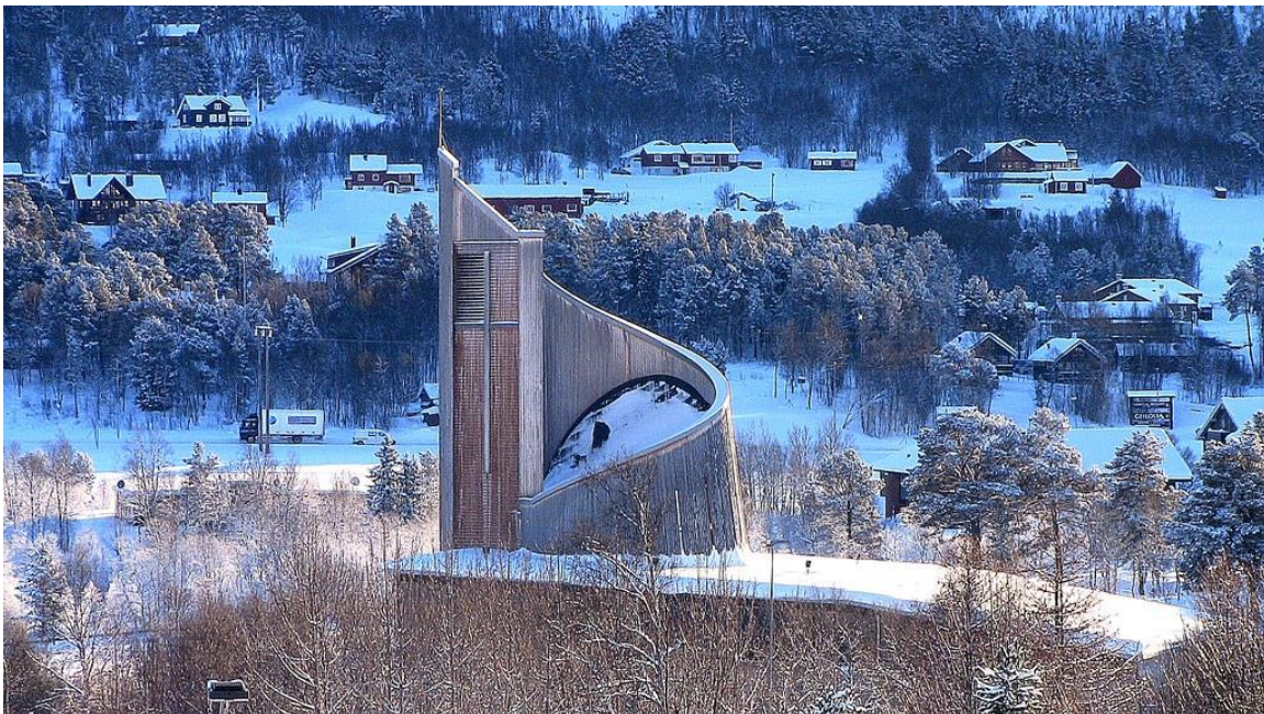
GEILO – NORWAY EXTRA WEEKEND TRIP / 11-13 MARCH 2022